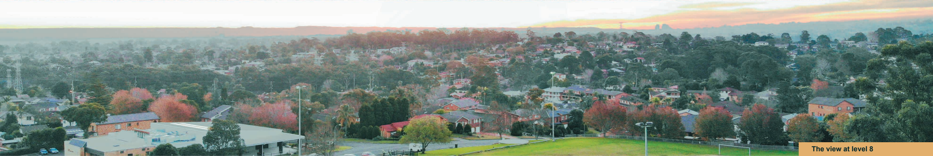
The view at level 8