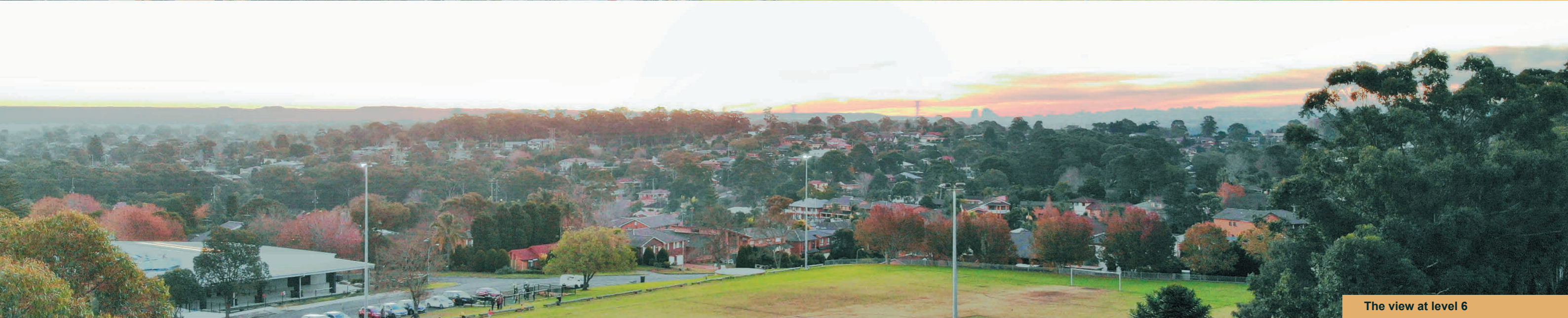
The view at level 6