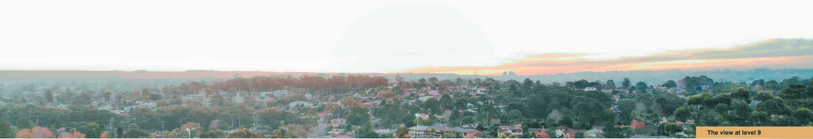
The view at level 9