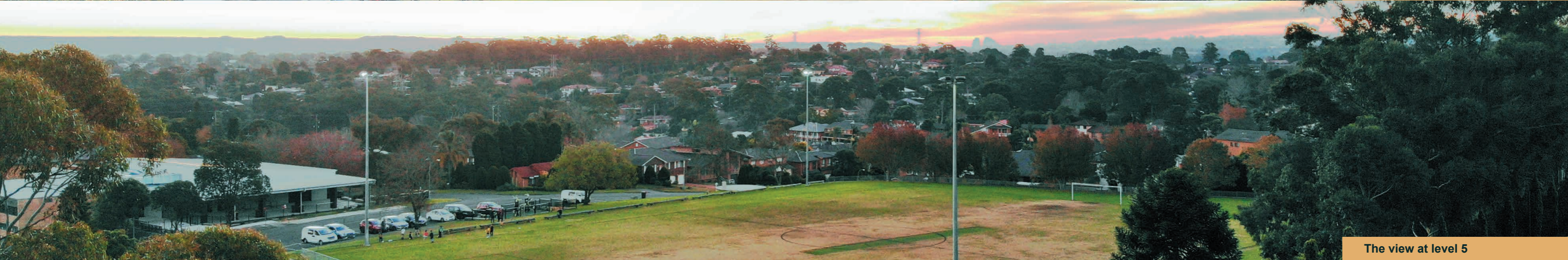
The view at level 5